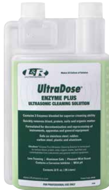
32 oz. Bottle Pr. Code: UD038

L&R Manufacturing Company 577 Elm Street, P.O. Box 607 Kearny, NJ 07032-0607 USA Tel: 201.991.5330 Fax: 201.991.5870