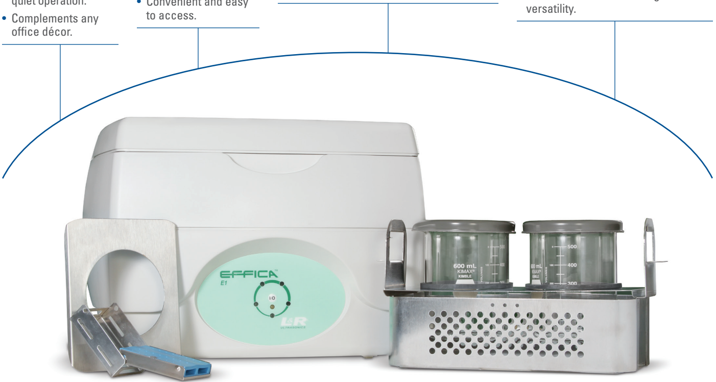
Shown with optional accessory kit